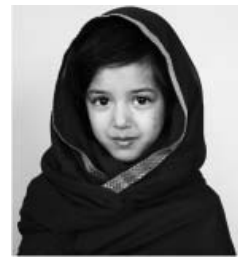
Malala in her childhood

Today, it is an honour for me to be speaking again after a long time. Being here with such honourable people is a great moment in my life. I don't know where to begin my speech. I don't know what people would be expecting me to say. But first of all, thank you to God for whom we are all equal and thank you to every person who has prayed for my fast recovery and a new life. I cannot believe how much love people have shown me. I have received thousands of good wish cards and gifts from all over the world. Thank you to all of them. Thank you to the children whose innocent words encouraged me. Thank you to my elders whose prayers strengthened me. I would like to