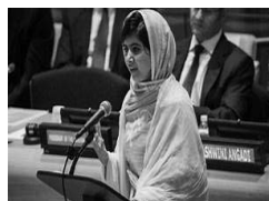
Malala delivering a speech in UN General Assembly

On the 9 th of October 2012, the Taliban shot me on the left side of my forehead. They shot my friends too. They thought that the bullets would silence us. But they failed. And then, out of that silence came, thousands of voices. The terrorists thought that they would change our aims and stop our ambitions but nothing changed in my life except this: weakness, fear and hopelessness died. Strength, power and courage was born. I am the same Malala. My ambitions are the same. My hopes are the same. My dreams are the same.